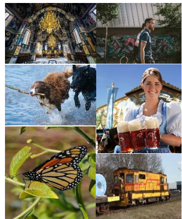
High-Quality Image Dataset