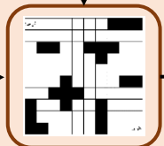
A^* path planning