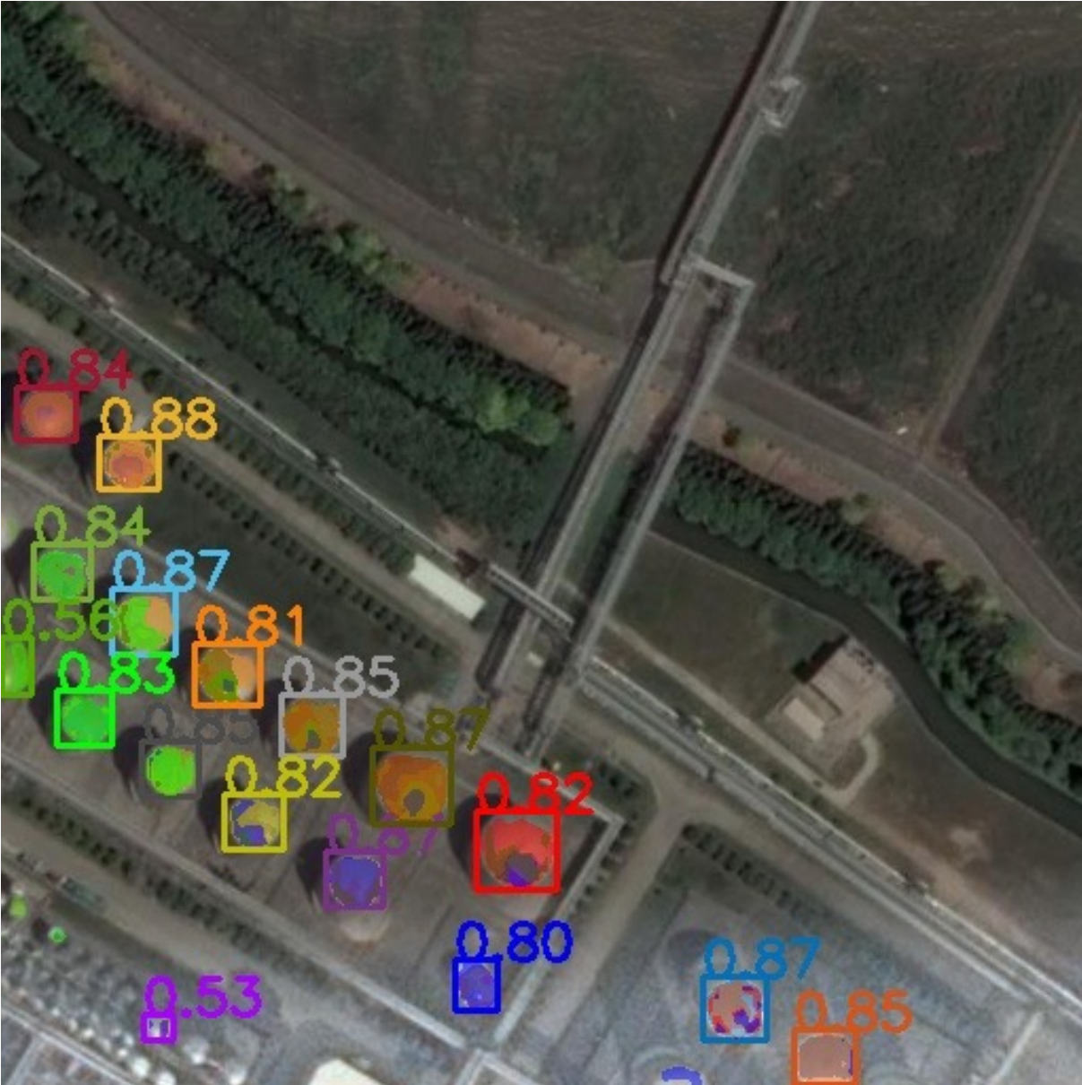
(a) Remote Sensing