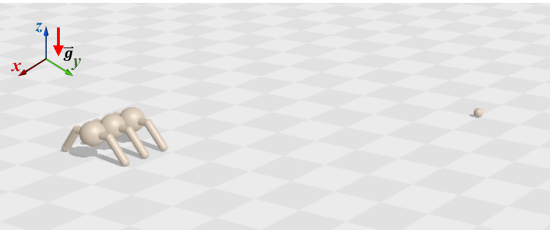
Training on 0^\circ