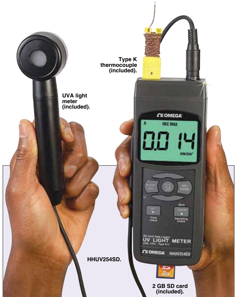
UVA light meter (included).

Many industrial and commercial applications require or can benefit from measurement of the intensity of UVA and/or UVC light. Among them are welding (to minimize exposure to "blue light" radiation), UV sterilization of food, photochemical matching, erasure of electrically programmable read-only memory (EEPROM) chips, production of graphic arts products, exposure of photoresists, and curing of inks, adhesives and coatings.