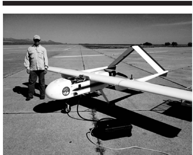
Figure 1. The Sensor Integrated Environmental Remote Research Aircraft (SIERRA) on the tarmac at NASA's Crows Landing Airport in California.

These SUAVs have advanced designs to carry small payloads and integrated flight control systems, giving them semiautonomous or fully autonomous flight capabilities. In autonomous UAVs, the acquisition of remote-sensing data is preprogrammed with flight planning software that can calculate waypoints for image acquisition based on the desired ground resolution, amount of image overlap, and area to be surveyed. Digital cameras are commonly part of the payload. During the flight, the UAV's autopilot can communicate via a telemetry link to a ground station running flight control software (Hugenholtz, 2012). For example, the AeroVironment RQ-14A "Dragon Eye" has a 110-cm wingspan and weighs about 2.5 kg. Launched by hand or with a bungee cord, the small plane is controlled by GPS coordinates entered into its guidance system with a standard laptop computer. Once aloft, it can transmit video images of the coastal landscape in real time (Edwards, 2009).