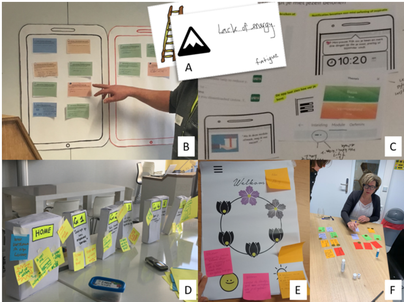
Figure 1. Examples of paper materials used in the co-design exercises. The co-design exercises are described in Table 1. (A) Obstacle card (session 1, first exercise). (B) Desired and undesired apps (session 2, first exercise). (C) Map of motivational elements (session 3, first exercise). (D) Cardboard boxes representing the app modules (session 4, first exercise). (E) Poster of a home page design (session 5, first exercise). (F) Card game about the tips (session 6, third exercise).