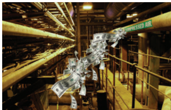
Figure 3: The average plant loses as much as 35 percent of compressed air due to leakage.

Leaks are very common and expensive in pneumatics systems, but many leaks can be prevented or fixed. Statistics from the U.S. Department of Energy show the average manufacturing plant experiences compressed air leakage in the range of 30 to 35 percent. (Figure 3)