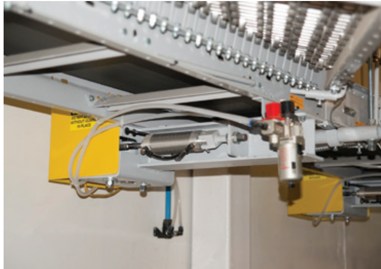
Figure 1: Pneumatic systems offer an untapped area for improving energy efficiency and cutting costs.

OEMs that understand their customers' needs and build more energy efficient machines and robots will be more successful than those who neglect TCO. The old business model of only caring about performance and not about efficiency is dying, and OEMs who include energy efficiency as part of the overall performance of their pneumatic systems will be the ones that beat out the competition. (Figure 1)