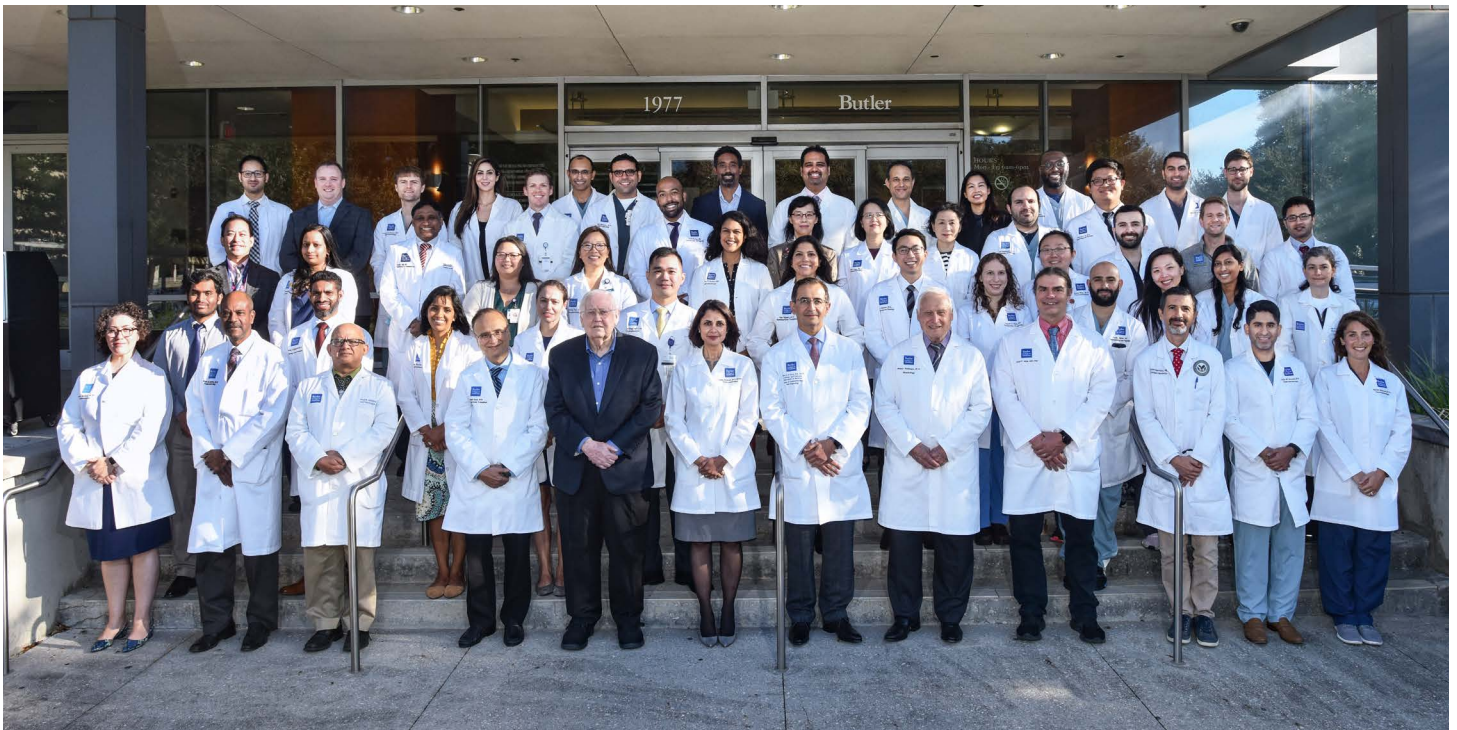
The 2021 Gastroenterology and Hepatology faculty and fellows.