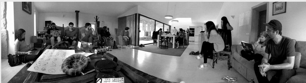
Meedan's Team Retreat

Meedan is a technology not-for-profit that builds tools and develops programs to strengthen global journalism, digital literacy, and accessibility of information.