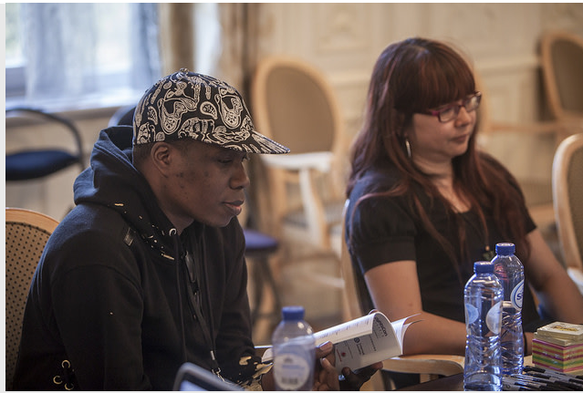
Rights Con, Brussels - March 2017

There is no question that this past seven years of our work has been a single long, and, from this vantage point, prescient, arc to the epicenter of the internet freedom and access issues that offer a serious threat to democratic systems around the world. We take this to be very much the challenge of our time, and a challenge that does not just impact political participation, but also public health, education, environment, and virtually every area of online discourse. We did not envision seven years ago that our idea for addressing verification in service of raising citizen voices would have put us in the middle of the effort to improve the very infrastructure of the web, but we are extremely proud that we have navigated our work to this point and are very grateful for the huge contributions to our work in 2017 from our funders, partners, and, most importantly, our users.