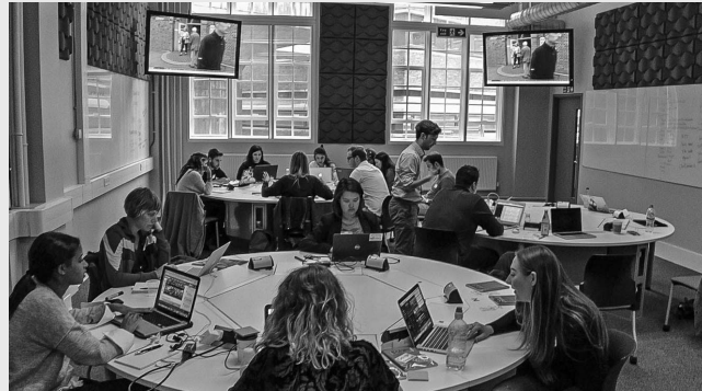
#GE2017 in the UK

Pop-Up Newsroom was founded in 2017 by Dig Deeper Media and Meedan and is an innovation framework for newsrooms that are changing the way they collaborate, communicate and engage audiences through new tools and training. Our structured approach to innovation — both technological and editorial — is unique.