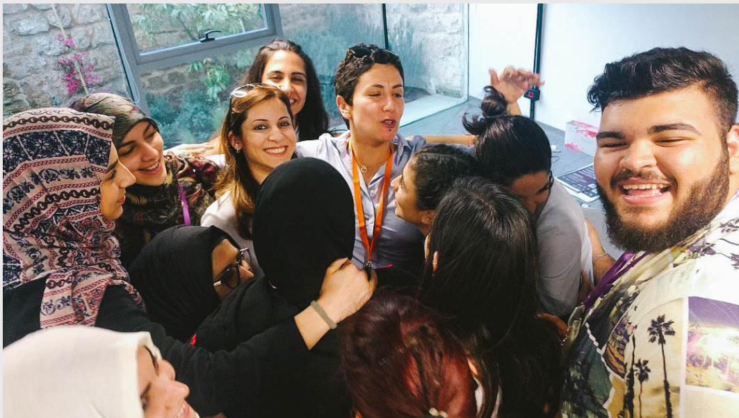
Check Con, Beirut - April 2017