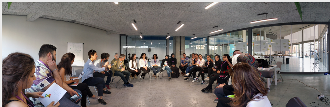
Beirut - April 2017