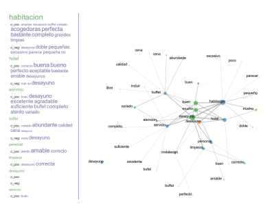
Fig. 4. Visualization of Cue and Target correlations across the whole corpus

By means of clicking the different facets that appear on the widgets, the user can build a query that restricts the set of opinions to summarize. These opinions are then summarized by showing the most frequent terms they contain, or the most differentiating ones (i.e. those terms that are frequent in the current subset but that are less frequent in the general one). Figure 4 shows the pivot result in text and force diagram formats. It shows the relationship between Targets, and positive and negative Cues. In the textual representation, the relationships are not shown directly but scaled to magnify the most discriminative ones.