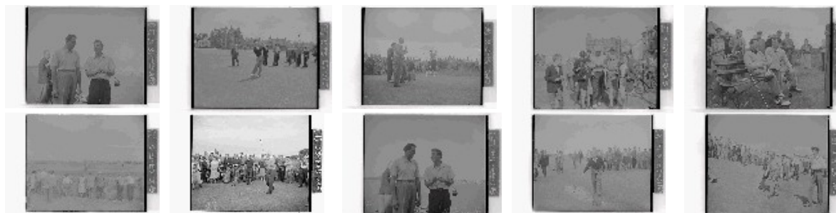
Figure 3. The top 10 images of Topic 13 in generated visual query run using manually selected terms

shown in Figure 3 are all about the Open Championship golf tournament, but are not the one held in 1939. It shows that using visual information only is not enough, integrating textual information is needed. After the result of manually selecting run merging with textual query run, the performance is slightly increased to 0.4427.