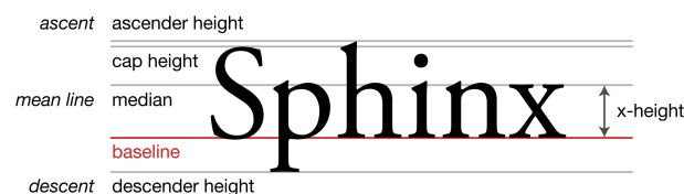
Fig. 1. Typographical Line Elements [FNT]

What is a mathematical formula? According to Wikipedia, in mathematics it is “ an entity constructed using the symbols and formation rules of a given logical language ”. Even though there are multiple mathematical communities of practice which use a partly different set of symbols and slightly varying formation rules, there is a common understanding how to encode several information levels into formulae by extending the linear form of text.