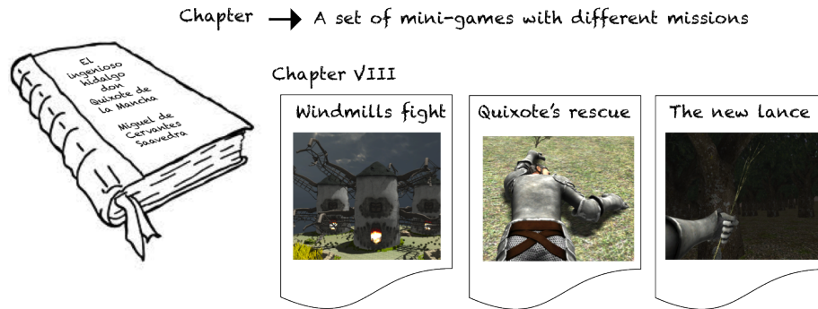
Fig. 2. Each chapter of the Quixote's novel is decomposed in a set of mini-games.

textualize in the epoch of the novel, from easiest to the most difficult one, the levels are denoted as page, servant, and knight.