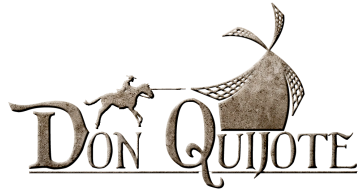
Fig. 1. The logo of the Don Quijote game.