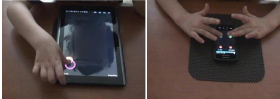
Fig. 1. Child performing simple and double drag gestures (extracted from [27]).

Another interesting work with pre-kindergarten children and tablets is the study by Nacher et al [14] which makes a preliminary analysis of communicability of touch gestures comparing two visual semiotic languages. The results show that the animated approach overcomes the iconic. Hence, basic reasoning related to the interpretation of moving elements on a surface can be effectively performed during early childhood. These languages could help children in identifying direct mappings between visual stimulus and their associated touch gestures. Therefore, the use of these languages could be particularly interesting in the development of games in which pre-school children could play autonomously.