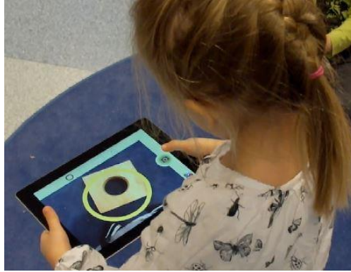
Fig. 2. Child interacting with CamQuest (extracted from [3]).

On the other hand, other studies have focused on the use of tabletops with educational purposes. For example, Yu et al [28] present a set of applications for children aged between 5 and 6 years. The applications contribute to the development of intelligence, linguistic, logical, mathematical, musical and visual-spatial aspects with activities such as listening a word and picking out the picture that represents it; shooting balloons with the right numbers, etc. Following the same research path, Khandelwal & Mazalek [11] have shown that this technology can be used by pre-kindergarten children to solve mathematical problems. The work of Mansor et al [12] conducts a comparison of a physical setting versus a tabletop collaborative setting with children aged between 3 and 4 years and suggests that children should remain standing during these operations because, otherwise, they find it difficult to drag objects on the surface due to bad postures.