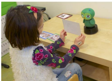
Fig. 4. A girl playing with an owl-shaped robot to foster language skills (extracted from [21])

Also aimed at improving language and literacy skills, Soute and Nijmeijer [21] design an owl-shaped robot to perform story-telling games with children aged 4 to 6. This robot (see Fig. 4) narrates a partial story which the students must complete showing some flashcards to it. A small study is also conducted during a game session and the results show the system is engaging for the kids.