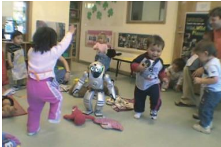
Fig. 6. Children dancing with QRIO (extracted from [24])

Another advantage of using robots is that they can move. Therefore, they can be used to enhance physical development. QRIO [24] is a humanoid robot introduced in a toddlers' classroom to make the kids move and dance, hence encouraging physical exercise. The robot would dance autonomously to the music (see Fig. 6) and react to the movements of a dancing partner (i.e., to his/her hand movements or clapping).