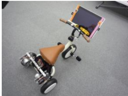
Fig. 5. Tricycle interface (extracted from [26])

Besides training linguistic abilities, other robots could also be used to develop spatial capabilities. For example, Tanaka and Takahashi [26] design a tangible interface for kids aged 3 to 6 in the form of a tricycle (see Fig. 5) to remotely control a robot. The movements performed on the tricycle (i.e., forward, backward, left, right) are mapped to movements of the tele-operated robot. Although not specifically built for this purpose, in our opinion this kind of interface could be used to stimulate spatial mappings on kindergarten children.