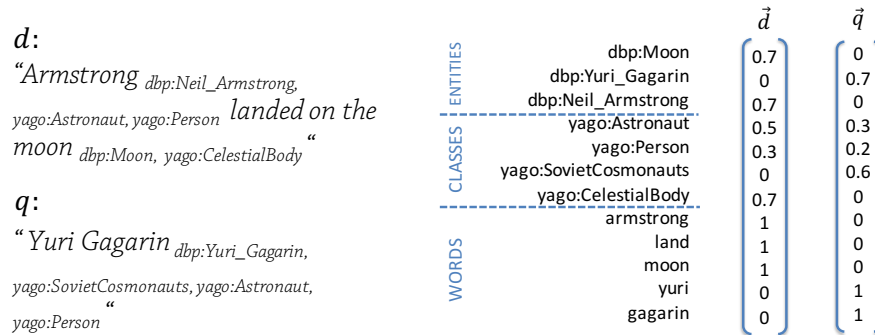
Fig. 2. Example document and query vectors in the taxonomic model.

The text index integrates into the model by appending the traditional document vector to the entity-based document vectors. Fig. 2 shows an example document d and query q annotated with entities ( dbp: ) and classes ( yago: ), as well as the corresponding document vector \vec{d} and query vector \vec{q} .