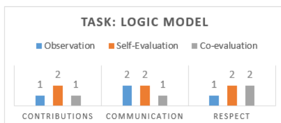
Figure 2. Information displayed in students' report.

Immediately after each session, students were asked to use the same dimensions to assess their peers' group work skills as well as their own, using the 0 to 2 scale. Additionally, the tabletop system sent the automatic generated report previously described, to students in the experimental group. Within three days after each session, all students received: a summary report comparing their self-assessment with both their observer's and group members' assessment (Figure 2); and guided questions to prompt a reflective writing on their group work abilities. The questions attempted to engage students in describing the activities carried out during the task, the obstacles found, their perception on the received feedback, and the actions students planned to take in order to improve their collaborative skills for the next group activity. For the final reflection, guided questions focused on prompting students to reconsider their initial self-assessments as well as on gauging students' perception of the tabletop usefulness. Tabletop usefulness was measured from 1 to 5, being 1: no useful and 5: very useful.