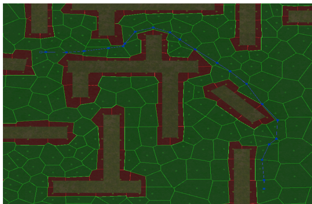
Fig. 3. Path finding

information seems to be a useful decision. The difference in 15–25% between smooth path length from our algorithm and the results from [24,25] is not too significant because we mainly focus on constructing realistic randomized paths for BOTs. We also create OWL reasoner to choose whether we have to use smoothing or piece-wise linear path to answer query for current combat situation like it is shown at the Figure 3. When implementing such an algorithm in 3D first-