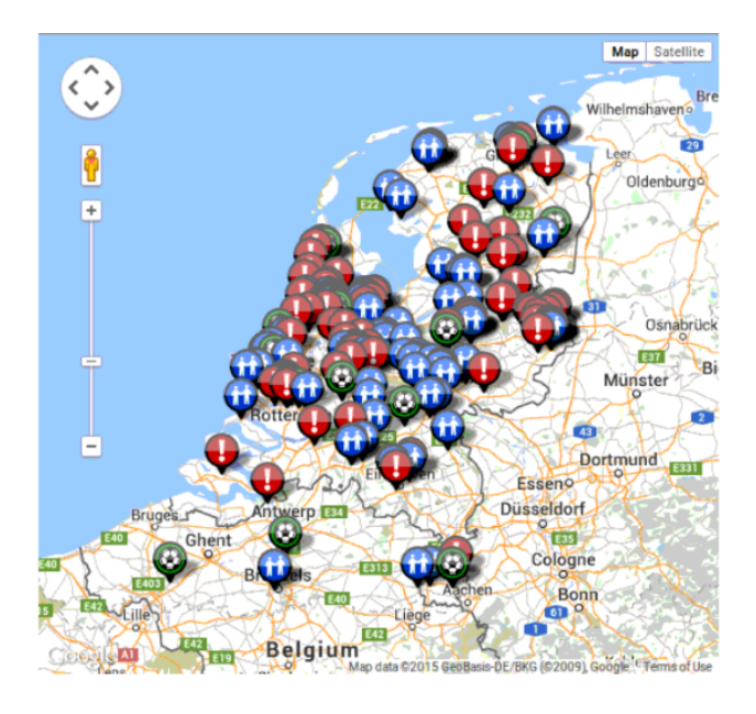
Figure 2: Visualisation of automatically classified events in The Netherlands, in April 2015 (de Kleer 2015).

to be most useful for this task were the most frequent words, the location using only the first five characters of the geo-Hash, the average word overlap between tweets in an event candidate and the average word overlap between different users in an event candidate.