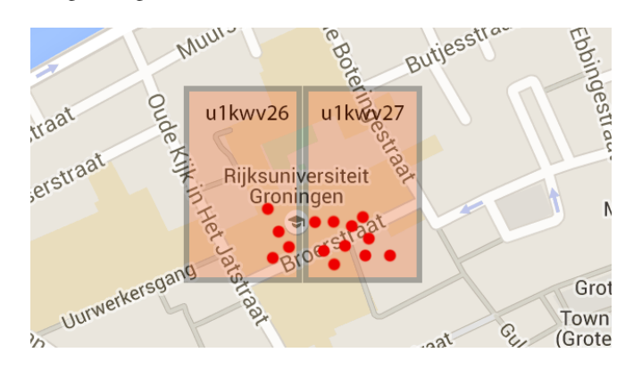
Figure 1: A border case in (de Kleer 2015)

All geo-tagged tweets from a month of Dutch Twitter data were used for training. This resulted in a total of 566.549 geo-tagged tweets. The geo-information was translated into a geoHash that denotes a specific area, and tweets with a similar geoHash and comparable timestamp were grouped and added to a list of event candidates. To handle the hard borders of the geohash area, candidates with matching timestamps in adjacent areas were then merged (Figure 1).