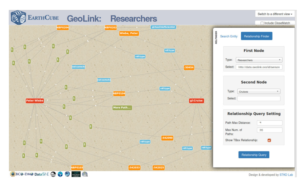
Fig. 3 Graph view showing cruises and datsets related to Peter Wiebe.

While entity-to-entity (e.g., between researchers Wiebe and Chandler) queries will yields results within a reasonable time even for 6-degree queries, these will likely time out for most entity-to-type queries as all entities of the given target type have to be taken into account. Typical use cases for the relfinder-style view include finding all researchers that are using the same instruments as a particular researcher or that went on the same cruises. Right-clicking on any nodes allows the user to switch seamlessly to the table or map view, to visualize the immediate (1-degree) neighborhood of said node, or to set this node as source or target node for further exploration. For compressed paths, their path lengths are shown as numbers. Figure 3 also show owl:SameAs relations between researcher URIs and between cruise URIs.