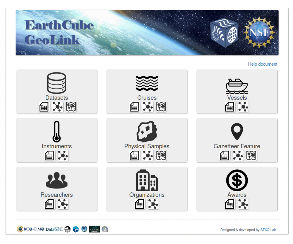
A Linked Data Driven Visual Interface for the Multi-Perspective Exploration of Data Across Repositories