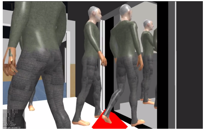
Figure 3. Elevator carrying people from one floor to the other

The problem becomes more complex when the activities of the daily living is added to the considerations. The protocol of lectures in a classroom is simple: students come to the classroom; they sit down; a teacher comes and starts the lecture; more students may come during the lecture; the lecture finishes and then all, or a few, students leave the room. The uncertainty in the process, such as teachers finishing sooner or later, makes the evacuation of students from classrooms more smoother than it should be if all teachers coordinated