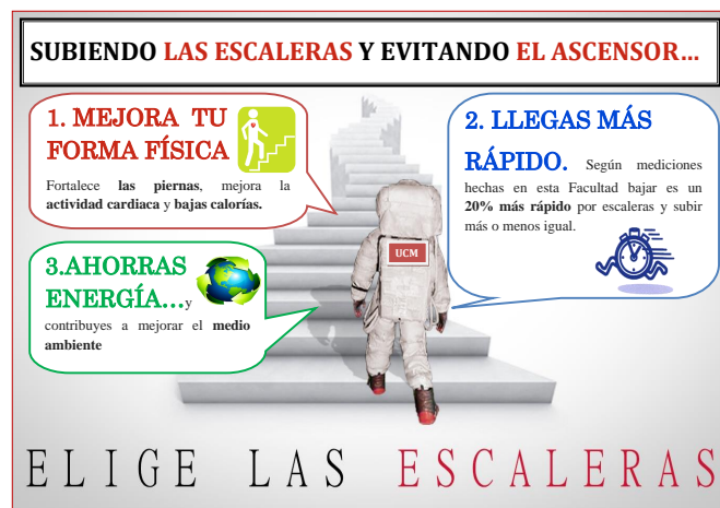
Figure 1. Banner for motivating users to use the staircase. It written in spanish. The main title says stair climbing and avoiding elevators at the top. The alleged reason are 1. improving your health , 2. You will get faster to your destination , and 3. you will save energy

A plan for measuring the effects of these stimulus was made. The plan consisted on a five week schedule. The first week (week A) there was no stimulus and it was used to collect a base line of staircase/elevator traffic stats; during the second week (week B) the banner stimulus was introduced; along the third week (week C1) the videos were added; and in the fourth week (week C2), the human-to-human interaction. Then, there were some days of no stimulus to let users decide whether they want to keep the new behavior or get back to the old one. Therefore, the fifth week (week D) is dedicated to measure the resilience of the stimulus.