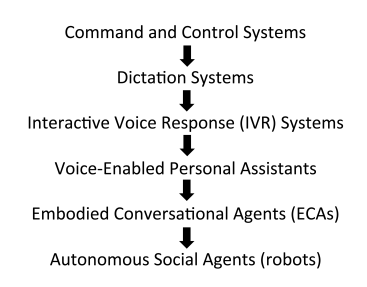
Fig. 1. The evolution of spoken language technology applications.

The performance of spoken language systems has improved significantly in recent years, with corporate giants such as MicroSoft and IBM issuing claim and counter-claim as to who has the lowest word error rates. Such progress has contributed to the deployment of ever more sophisticated voice-based applications, from the earliest military 'Command and Control Systems' to the latest consumer 'Voice-Enabled Personal Assistants' (such as Siri ) [1]. Research is now focussed on voice-based interaction with 'Embodied Conversational Agents (ECAs)' and 'Autonomous Social Agents' based on the assumption that spoken language will provide a 'natural' conversational interface between human beings and future (so-called) intelligent systems – see Fig. 1.