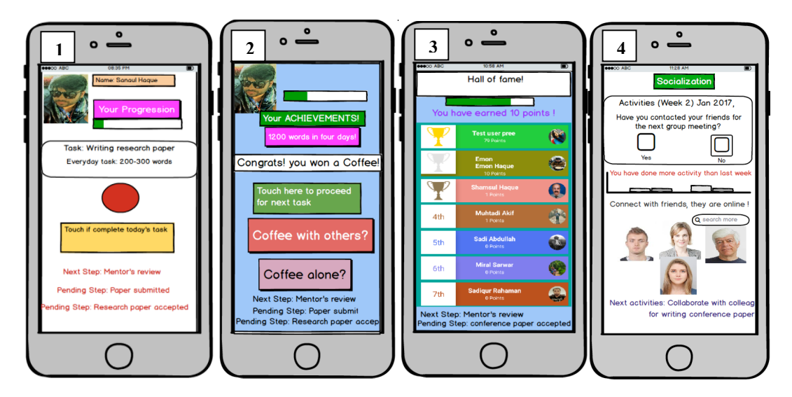
Figure 4. Mock-up UI (the system model to a prototype of an app).

The social display menu allows them to check other colleagues who are online and a chance to meet them for a coffee break as well as comparing individual weekly progress (screen 4).