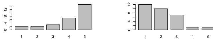
Fig. 6: Student rating of the sentences “The tool was helpful for my preparation” (left) and “The paper-based version would have been sufficient.” (1=strongly disagree, 5=strongly agree).

Students were also asked to provide feedback at the end of the test. Only students that had used the tool provided answers to these questions. Fig. 6 shows the distribution of answers for two examples: We asked for the students to rate the sentences “The tool was helpful for my preparation” (left) and “The paper-based version would have been sufficient.” (right). Answers were provided on a Likert scale where 1 means ‘strongly disagree’ and 5 means ‘strongly agree’. Overall, the students appreciated the tool support.