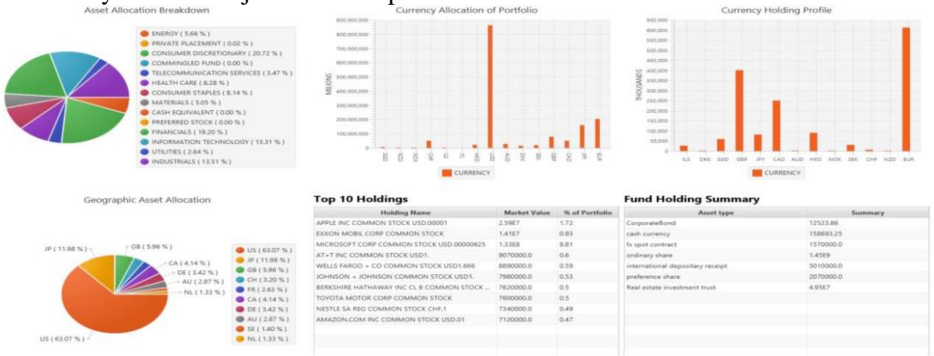
Figure 3. Sample representation of a fund at point in time.

Figure 3 provides a view of a worked sample of a dynamic fund report. This report provides a summary view of the fund at a point in time represented in an easily digestible manner by finance subject matter experts.