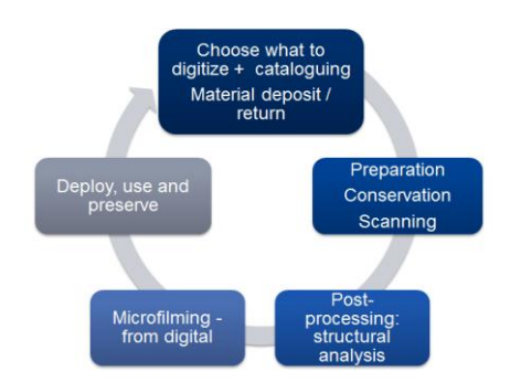
Fig. 1. The Digital Chain of National Library of Finland

The duty of the NLF is to deposit and preserve everything published in Finland. According to the Legal Deposit Act, the NLF receives a copy of each newspaper and magazine published in Finland. Received publication materials are processed in the library according to an internal concept called the digital chain. Processing of the publication material in the digital chain consists of the following five phases: 1) material deposit and return (including cataloguing); 2) preparation, scanning and conservation (if needed); 3) post-processing, which includes structural analyses; 4) microfilming from digital version; and 5) deployment, use and preservation. The digital chain is schematically presented in Figure 1.