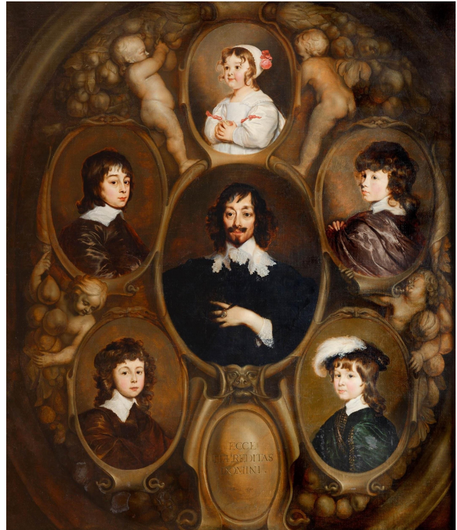
Figure 2. Adriaen Hanneman, Portrait of Constantijn Huygens (1596-1687) with his five children (1640). Oil on canvas. Mauritshuis, The Hague

ECARTICO is available online since december 2011 under a liberal license. At the moment of writing ECARTICO contains structural biographical data on over 36 000 persons