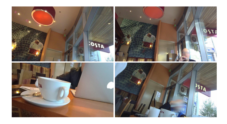
Fig. 4. The results of query 2

that meets the information in the query. Figure 4 show the retrieved images corresponding to the query.