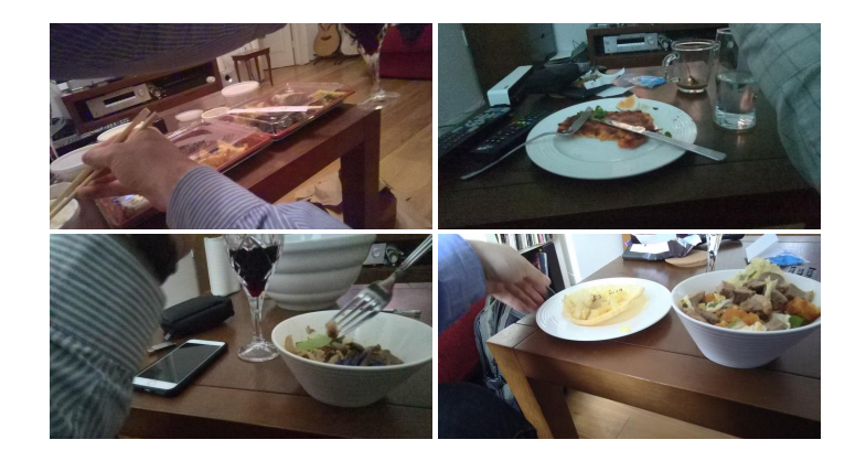
Fig. 5. The results of query 3

Query 4: Find the moments when I was giving a presentation to a large group of people. To be considered relevant, the moments must show more than 15 people in the audience. Such moments may be giving a public lecture or a lecture in the university.