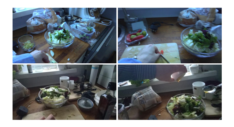
Fig. 3. The results of query 1