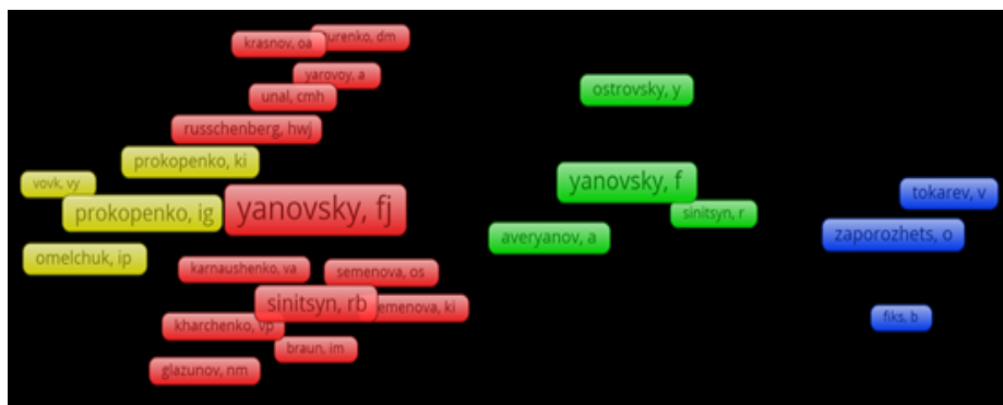
Fig.1. Co-author network using Web of science papers of the university team

The relationship between the terms in publications is shown in Fig. 2, where each node represents a term. The size of the node corresponds to the frequency with which this term was used. Depending on the clusters by a frequency of simultaneous use the terms are displayed in different colors. The same color is indicated by terms that are often used together in one publication. The three most common terms of the network are signals processing, signal radar, aircraft and others. The combination of co-author networks and co-word networks makes it possible to identify the teams that work the most on a given topic. At the next stage, it is possible to rank and allocate leaders of scientific directions. The databases of scientists are used for person identification after receipt on the basis of co-authorship and terms. The databases give an opportunity to test the experience of authors, to separate authors with similar names