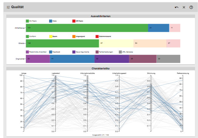
Figure 3: The Quality view.

Another central part in our investigations is the evaluation of our prototype. We conduct a quantitative usability study after the end of the first implementation cycle to assess the overall system and to counteract any weak points. Seven participants are observed while solving real world problems with our prototype. In addition, they answer a questionnaire about the usability. The findings are used for improvements and further requirements. The evaluation also reveals that the participants unconditionally trust the results. This is not surprising as the tool does not show the accuracy of the analytical results.