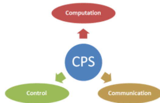
Figure 1: CPS capabilities

The coordination between cybernetic world and physical world by connecting with human through computation, communication and control is a key factor for future technological developments that changes future computational facilities in all areas including business, science, defense, and healthcare with unprecedented capabilities [Bah11].