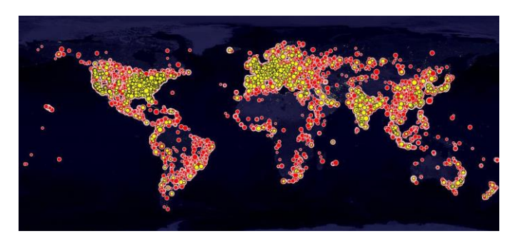
Figure 1: Global users of HUBzero-based science gateways

The last decade has led to diverse, mature, science-gateway frameworks such as HUBzero [12], the Agave Platform [13], Apache Airavata [14], and Galaxy [15]. Their worldwide usage is an example for the potential of sharing science gateways