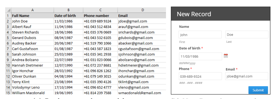
(a) Student records spreadsheet (b) New Record creation form

Action Logger records user actions performed in Excel and Chrome web browser, two often used applications for office tasks. It includes two separate plug-ins, one for each application. The plug-ins are implemented as event listeners and send the information about performed actions as JSON objects to the logging component, which generates and updates the UI log on the fly. To record the actions, the logger uses APIs of the corresponding applications. The browser actions are recorded at the level of the Document Object Model, capturing the involved web elements, e.g., text fields, buttons, and links. The tool also monitors the clipboard to record relevant actions, e.g., copying and pasting of files.