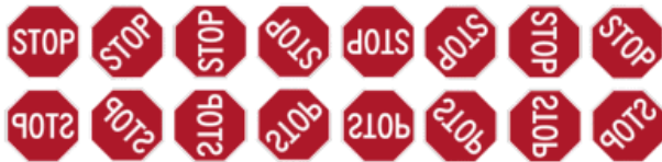
Figure 4. Front-view and rear-view for the stop sign as an example of degenerated regular polyhedron. The sixteen elements of dihedral group D_8 on a stop sign: The first row shows the effect of the eight rotations, and the second row shows the effect of the eight reflections.

So far, we have considered D_4 to be a subgroup of O(2) , i.e. the group of rotations (about the origin) and reflections (across axes through the origin) of the plane. However, notation D_n is also used for a subgroup of SO(3) which is also of abstract group type D_n : the proper symmetry group of a regular polygon embedded in three-dimensional space (if n \geq 3 ). Our reference diagram may be considered as a degenerate regular solid with its face counted twice (front-view plus rear-view). An example is given in Figure 4.