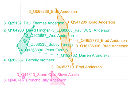
Fig. 2. Result of K-means clustering applied to Wikidata embedding

we have decided to consider the high-scored clusters instead of relying entirely on the first one). Other clustering algorithms shall be tested that may be more accurate to find the best compromise between having all candidates in the same cluster and enough clusters for good discrimination between candidates.