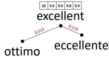
Figure 1: Example: word sub-graph associated with excellent . Original language = English, target language = Italian, K = 5 , \alpha = 0.4

weight of the edge connecting words x and x' indicates the pairwise word similarity in the latent space and is computed using the cosine similarity [15]. To avoid introducing unreliable word relationships and to limit graph connectedness, we filter out the edges (links) with weight below a given (user-specified) threshold \alpha . The effect of parameters K and \alpha on the performance and complexity of the proposed approach will be discussed in Section 5.