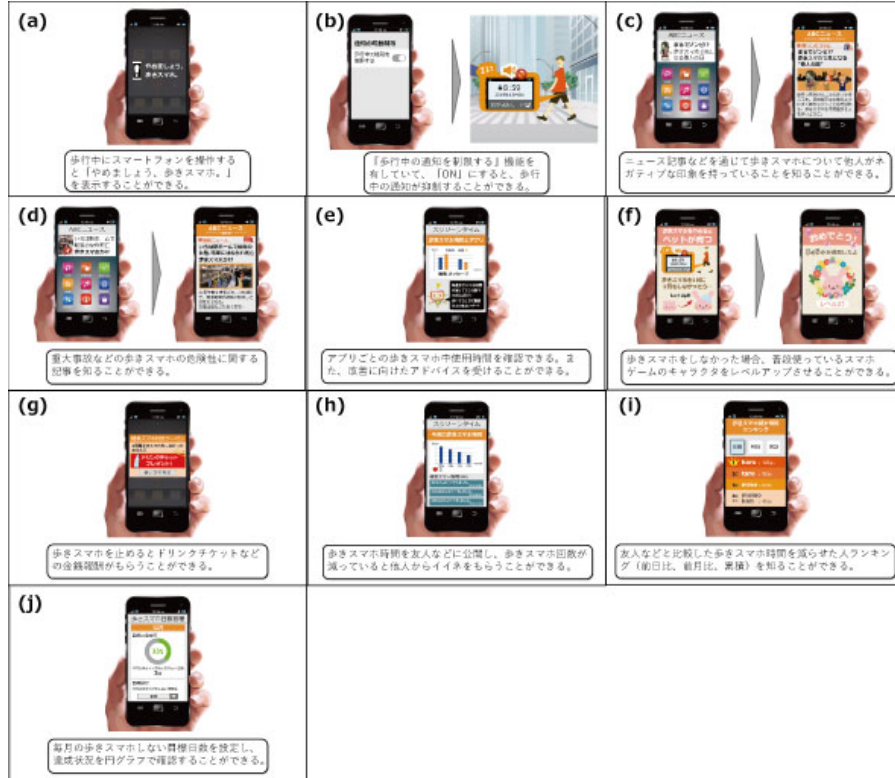
Fig. 2. Intervention methods

In the intervention part, we collected the subjects' preferences for smartphone applications which could encourage users to stop smartphone zombie behaviour. We asked subject to choose three of their favourite and one least-favourite intervention applications they would be willing to install on their own smartphone. Figure 2 shows the intervention applications shown in the questionnaire. Table 1 shows the description of each App. We have created the intervention applications by a behaviour change support systems (BCSS) and persuasive systems design (PSD) model with guides on how to change people's attitudes or behaviour [15].