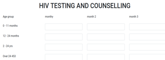
Figure III-1: Paper Sketch to HTML form

A notable positive aspect with Sketch2Code was that HTML source code generated by the platform could be imported into the DHIS2 CKEditor, created largely well-structured forms.