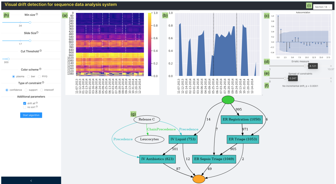
Figure 2: The user interface of the VDD system, running on the Sepsis event log [13]. (a) Drift Map. (b) Drift Chart. (c) Autocorrelation plot. (d) Erratic measure. (e) Spread of constraints view. (f) Incremental drifts test. (g) Extended Directly-Follows Graph. (i) Behavior cluster selection menu.