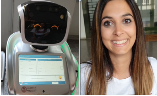
Figure 1: The iSanbot application for emotion detection.

feedback given to the user (for example, stimulating the interaction).