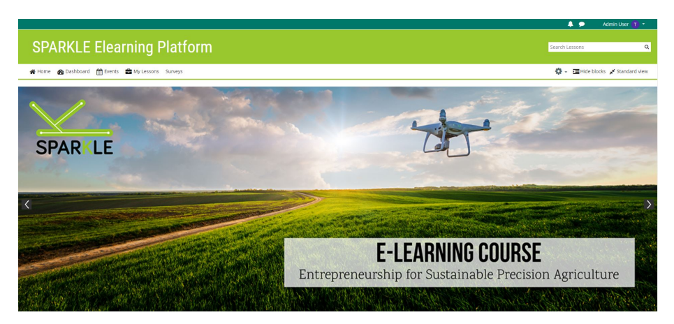
Fig. 1. The Home Page of SPARKLE E-Learning Platform.

One of the main aims of the SPARKLE project is to develop and assemble the e-learning supporting materials for the SPARKLE e-Learning Platform (general guidelines for attendees, materials and quizzes/tests/etc.). For this reason, a set of technical criteria were suggested for the development of the e-learning course. The SPARKLE project e-learning course is an asynchronous online course (courses where students are not required to participate in sessions at the same time as the instructor) using a learning management system. The e-learning courses are designed for large numbers of participants, offered for free and without any entry qualifications. The course is being provided through MOODLE Platform and for a specific number of participants, mainly students and precision agriculture users, lead to an ECTS recognized certificate. Moodle is an open-source Learning Management System (MOODLE, 2020). The advantages of Moodle are: 1) provides detailed guides on how to set up an e-Learning Platform, 2) provides tips on how to create online training courses and teaching programs and 3) it has a large community of users who interact on various topics. Finally, it has no charge fees and supports the use of mobile phones.