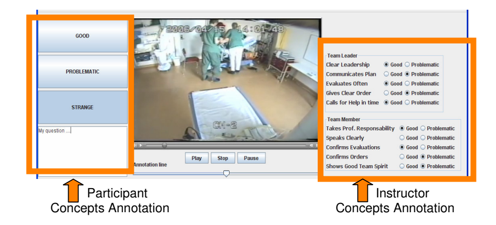
Fig. 2. Events to annotate by participants and instructor for the pediatric use case.

The content item is a video that has a name, a description and an author, in addition to the date and the place the movie has been filmed. A single type of fragment is used. It consists of a sequence of images defined by the number of the first image and the number of last image. The concepts used during the annotation are events observable in the movie scene. An annotation is described by the name of the author and some other information related to the role of the author (instructor or participant) ( Fig. 2 ).