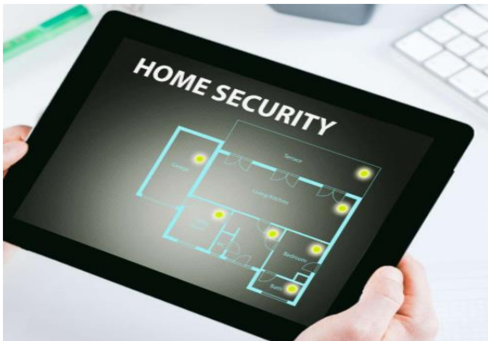
Figure 1: Smart home security

One advantage of having a smart home is the convenience it can add to your daily routine. You can program lighting, security, ventilation, heating and other functions to meet your daily needs. You can also control many features in your home remotely. You can always customize what you choose to make part of your smart home.