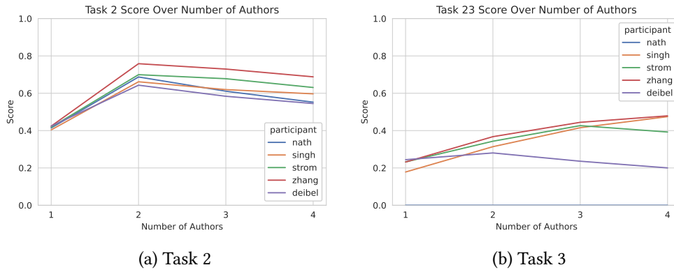
Figure 3: Scores ( F_1 ) for all Task 2 and Task 3, depending on the true number of authors in a document.

Finally, we looked at how the performance of the submitted approaches changes depending on the true number of authors per document. We performed this analysis for Task 2 and Task 3. The results can be seen in Figure 3. Looking at the results, we can see that the performance for Task 2 peaks at two authors for all approaches. In other words, all submitted approaches are best at determining style changes between paragraphs when the document was written by two authors. A different picture presents itself for Task 3. For two of the submitted approaches (Zhang et al. and Singh et al.), the performance keeps increasing with a growing number of authors. They perform best if the document was written by four authors. This suggests it may be interesting to increase the maximum number of authors per document for a future edition of the task.