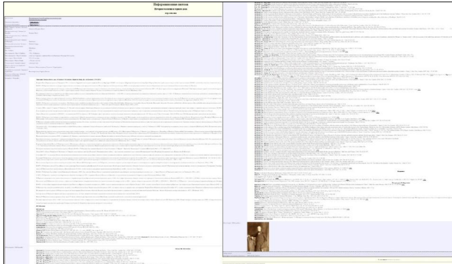
Fig. 2. Screenshots of the webpage about Roderick Murchison (1792–1871), Honorary member of the Imperial St. Petersburg Academy of Sciences, since 1845

The Information System is built and assembled according to the personal principle. The main objects are scientist personalities with other information connected: the places of work (institutions), bibliography, documents, photographs and other information with descriptions and sources. The personal information includes also main biographical data, fields of interest, geography of research works and full lists of publications and secondary literature (Fig. 2). Some bibliographical references are linked with available open Internet sources as full text publications.