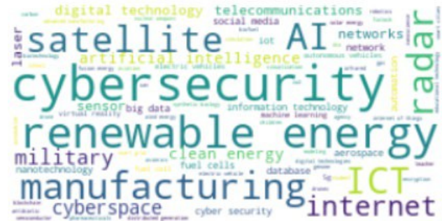
Figure 2 WordCloud of extraction result

We conducted statistical analysis on the keyword extraction results, selected the top 120 keywords in terms of word frequency, and generated the word cloud map by python program as follows