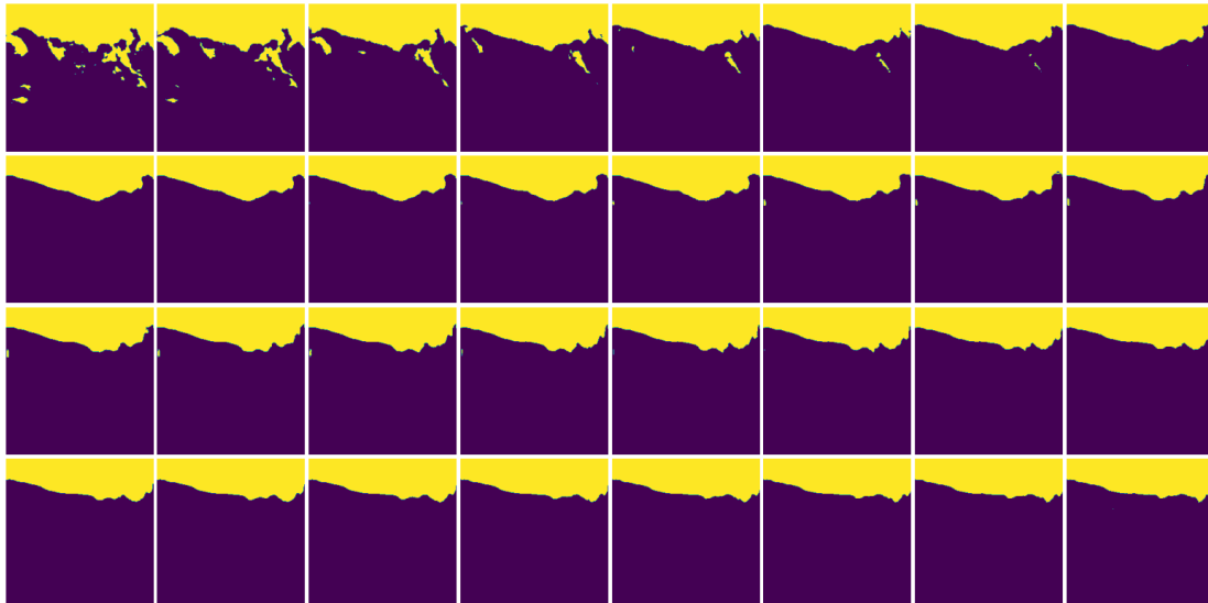
Figure 3: Predicted results from our best performing model for December 25th on Region R1 (Nile Region)