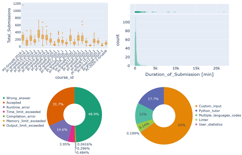
Figure 1: Results of the calculated measurements and metrics. a) Top-Left: Distribution of Total_Submissions per student in each course. b) Top-Right: Histogram of average time between attempts ( Duration_of_Submission ) for each student. c) Bottom-Left: Total verdict rates obtained in all courses. d) Bottom-Right: Total rates of tool usage across all courses.