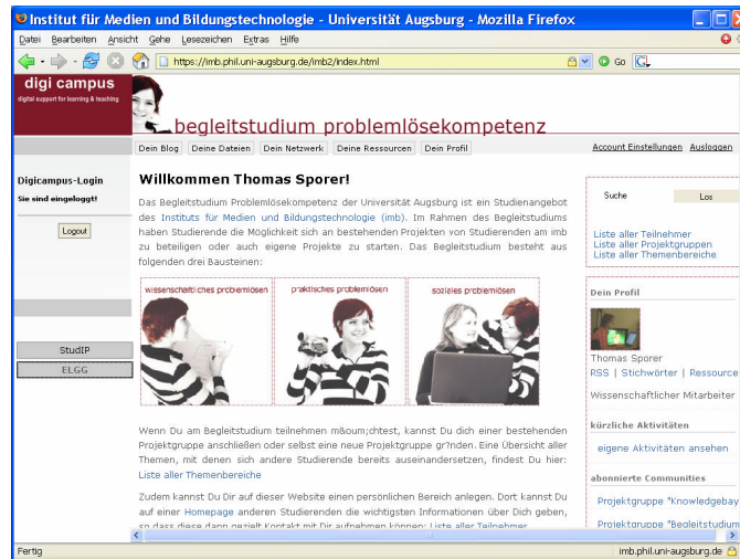
Fig. 1. Social Software Platform to Support the Project Groups within the Study Program

The social software platform depicted in figure 1 allows users to choose between different levels of access to the personal and community sites. Students decide for themselves who they share which kinds of information with.